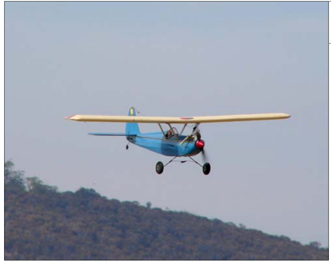
The Barnstormer helped Nils get bronze wings.