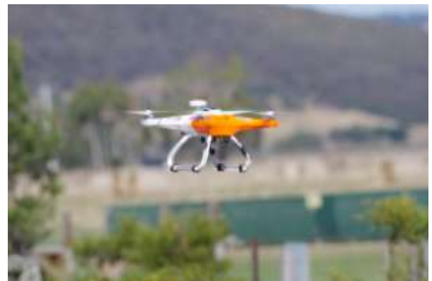
The old and the new