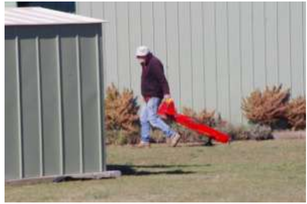
Is he coming or going ?