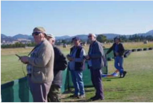
A picture of concentration