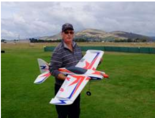
One of Garth's models sent to a more loving home!