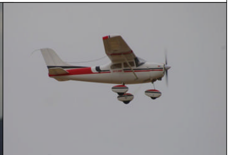
Nat Vervaart's CMPRO Cessna 172.