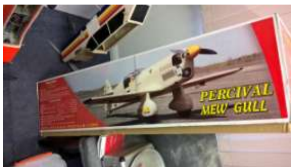
Percival $200.00 ono