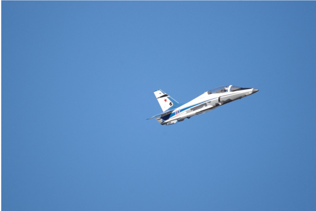
Damian Blackwell's Viper.