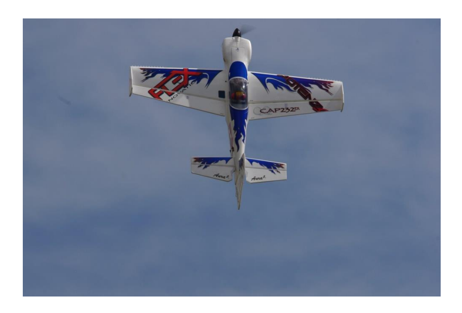
Damians Cap 232