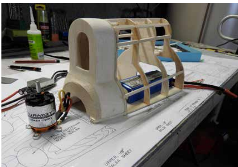
'The beginning of the body, building it upside down first and then I will turn it over and add the top.'