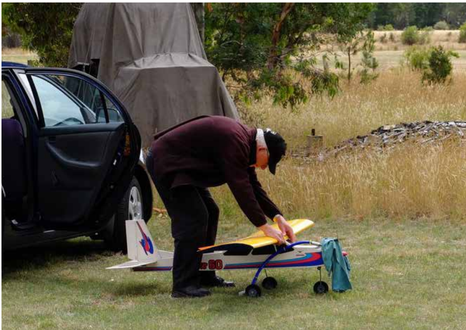
The model with high visibility yellow and blue striped wing is an old rudder/elevator/throttle design. It flies beautifully.