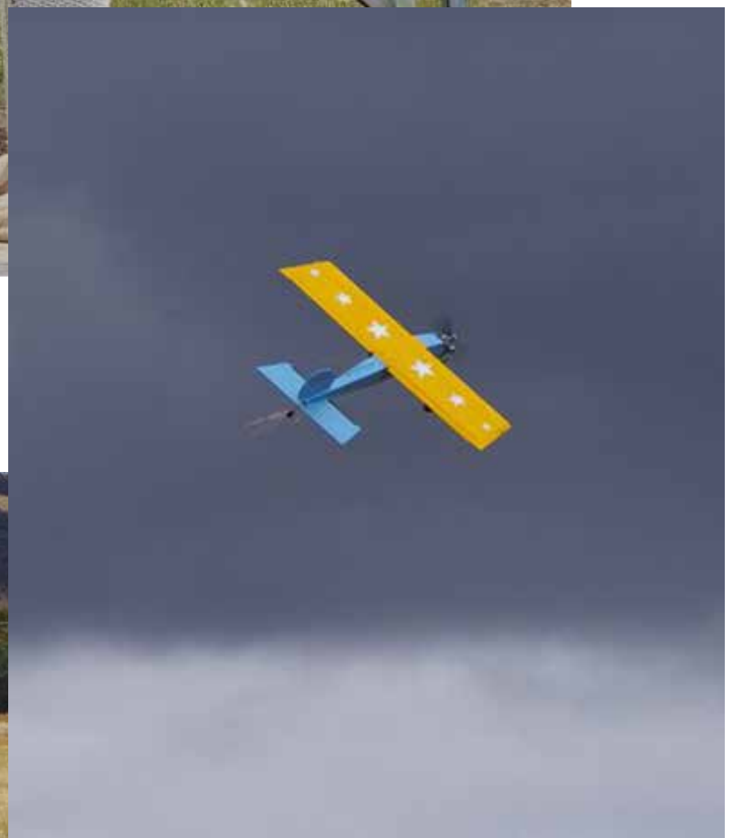
Ewin and model in action.