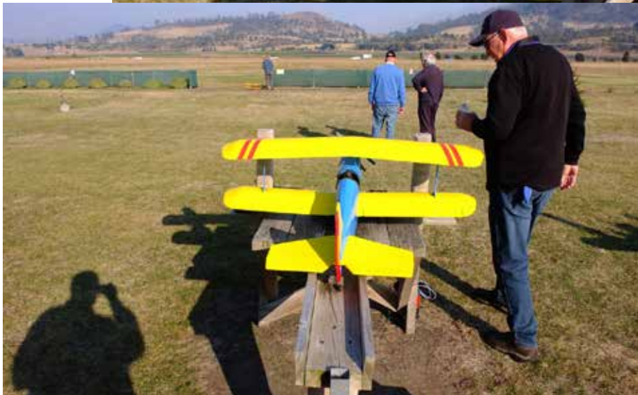
Biplane is a Precedent Bi Fli owned and built by Glenn Pearce. It is powered by a brand new OS 60 FSR of the same vintage as the model.