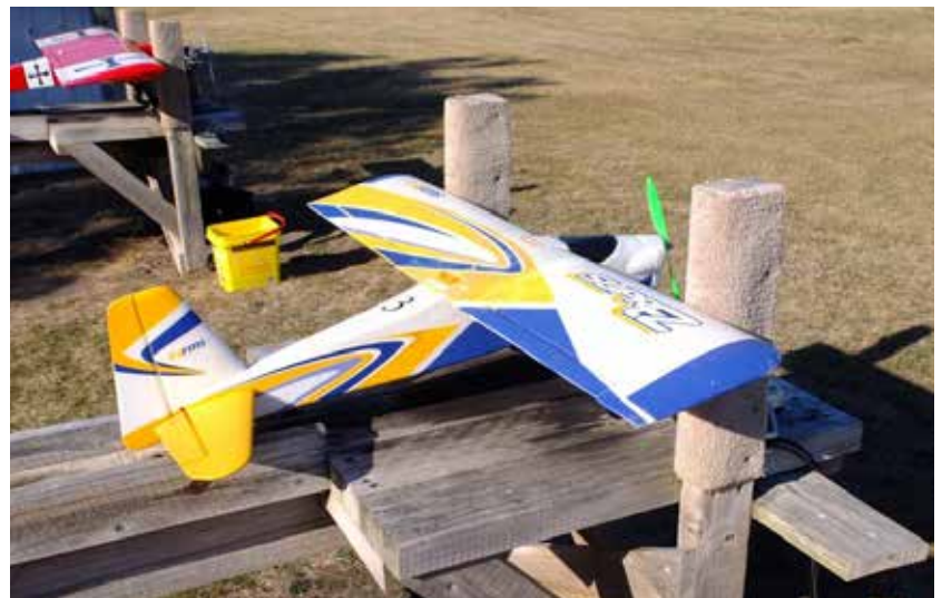
HMAC's long suffering and now long serving but seemingly indestructible club trainer. Has had several "nasties" but has bounced back and is still assisting in turning novices into competent pilots.