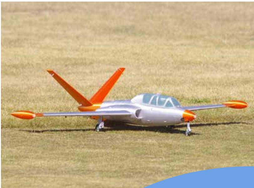
Damian Blackwell's Magister. (see April '22 Issue).

First flight completed safely so now time to start work on the decals. Could be a windowed canopy and may be a pilot or two in the time line as well.