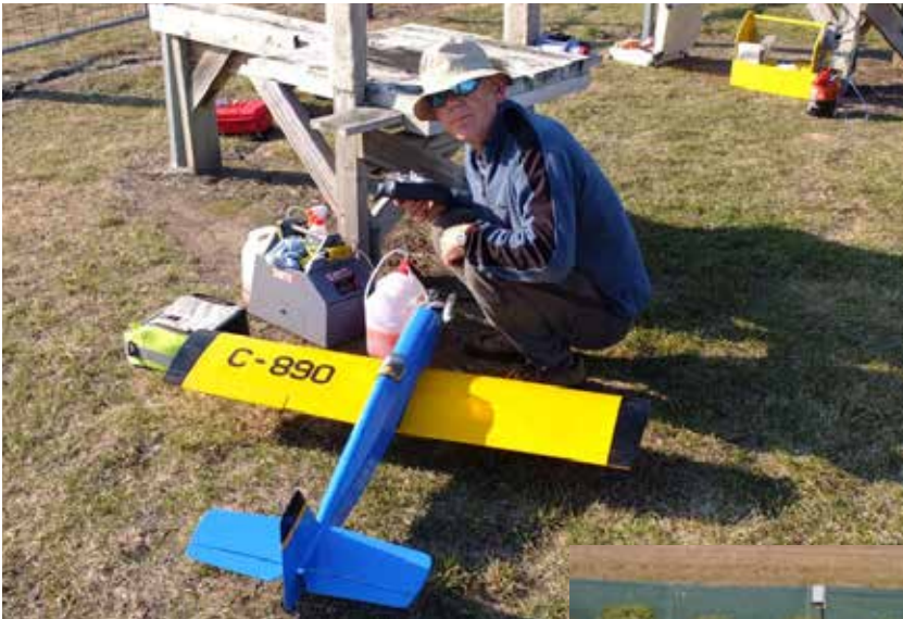
Phil's Pussyfoot. Plan dates back to about 1980 and model built about then. Has been re-painted a couple of times.