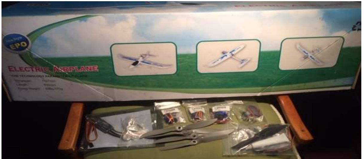
First time opening the box.

https://hobbyking.com/en_us/h-king-axn-floater-1280mm-pnf.html