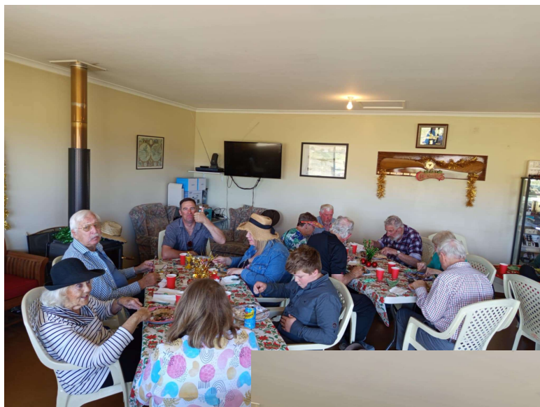
Christmas Lunch 2024