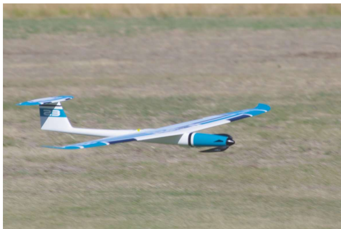
A new model for Gabriel